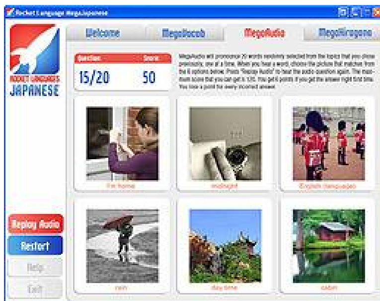
Screen shot of the Rocket Japanese audio comprehension learning game.

In the audio comprehension game, users play an audio clip of a word or phrase in the target language and select the corresponding word or phrase from six options displaying image and a translation.