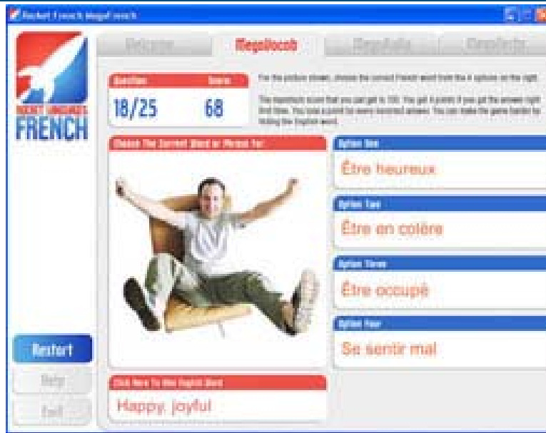
Screen shot of the Rocket French vocabulary learning game.

In the audio comprehension game, users play an audio clip of a word or phrase in the target language and select the corresponding word or phrase from six options displaying image and a translation.