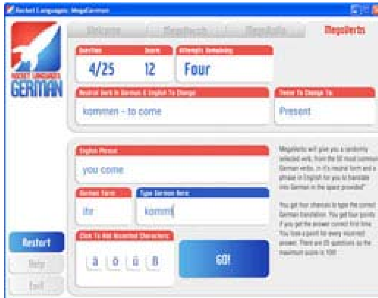
Screen shot of Rocket German verb learning game.

The verb practice game differs from the other two in that it involves writing in the target language. Users are given a verb from a database of 50 of the most common verbs in the target language, and also a tense to change the verb into. They type the conjugated verb into the answer field.